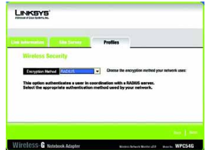
Figure 6-24: RADIUS Settings

Click Next to continue or Back to return to the previous screen.